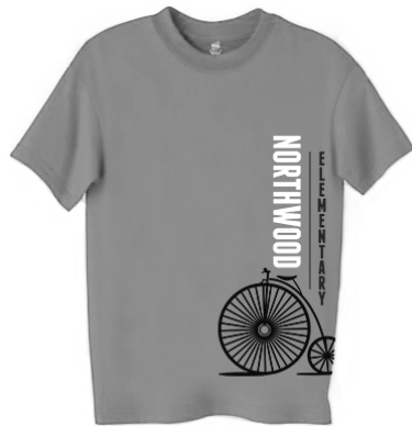
T-Shirt Available in Red