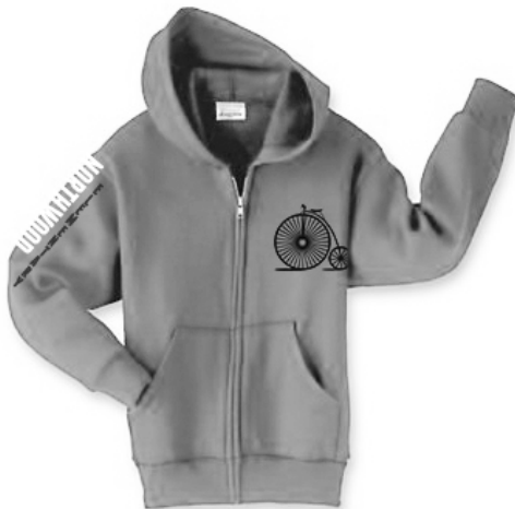
Hoodie Available in Black and Red